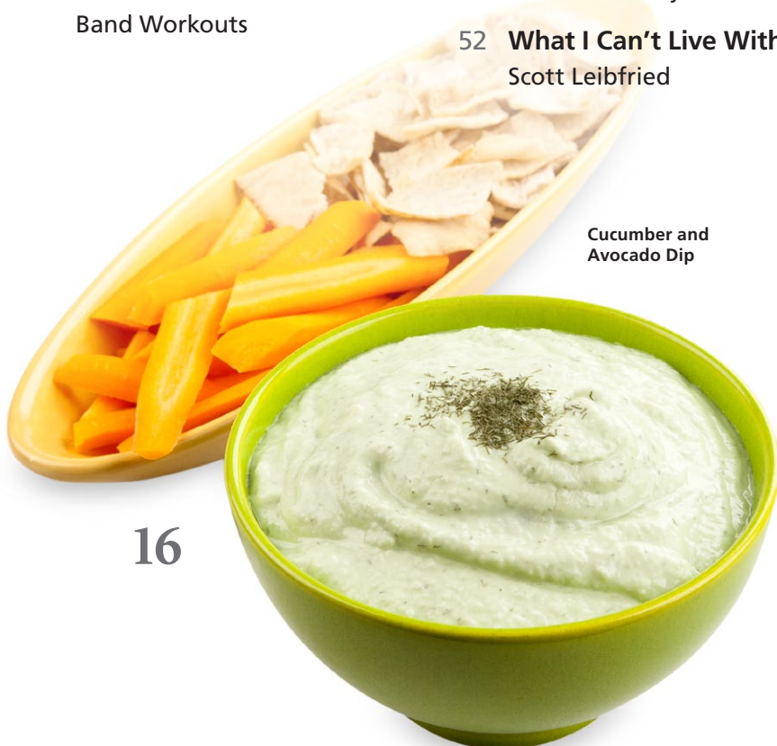
Cucumber and Avocado Dip