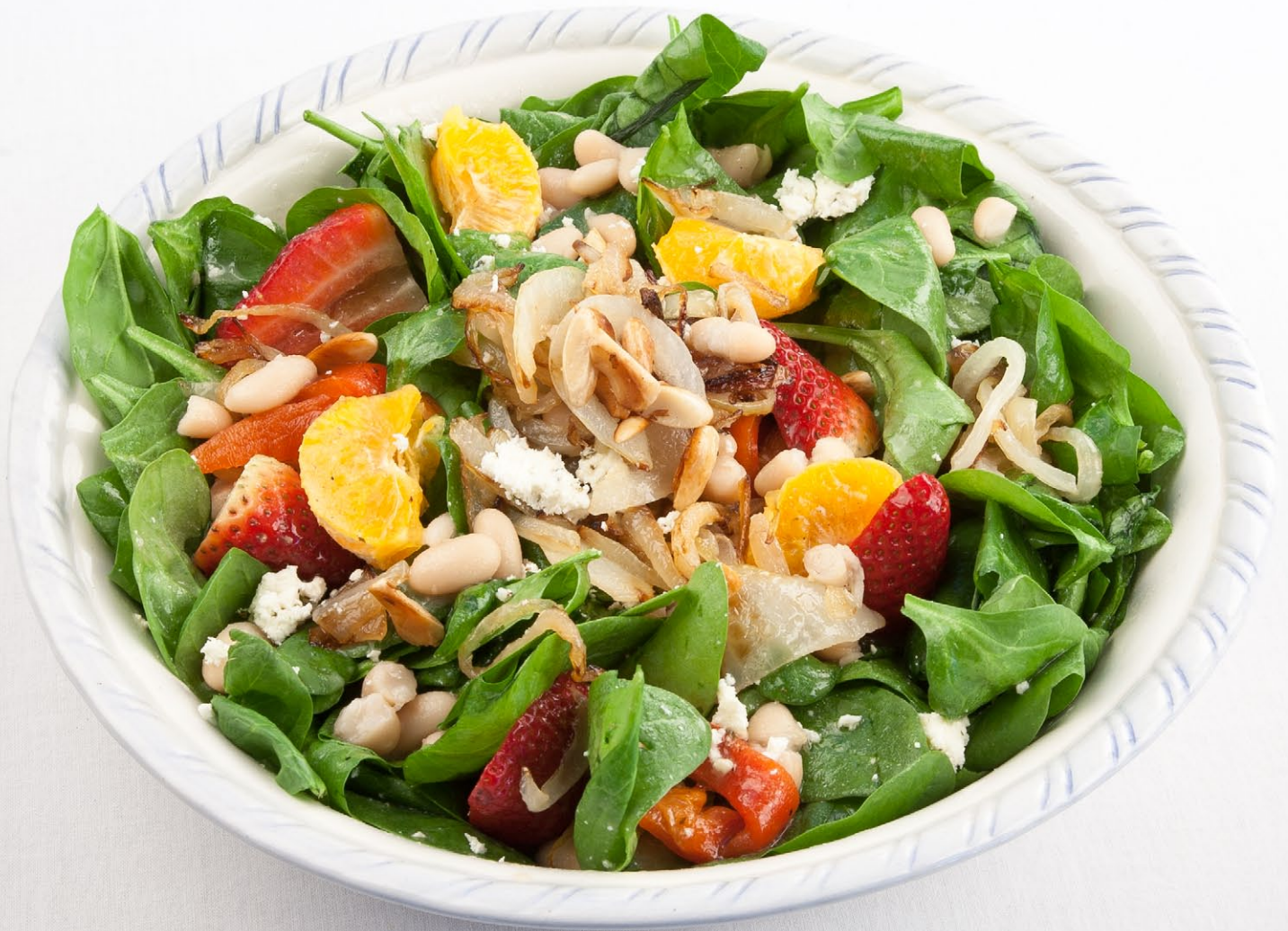
Baby Spinach Salad With Strawberries and Caramelized Onions